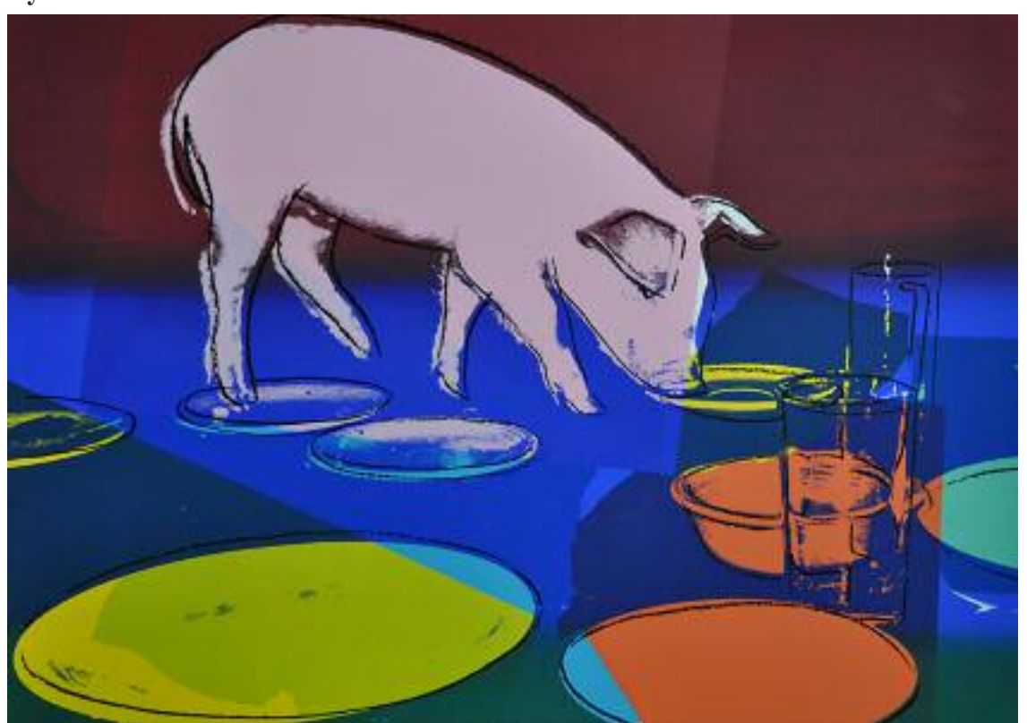
Andy Warhol, Fiesta Pig, 1979, Screenprint on Arches 88 paper, 21 ½ x 30 ½ inches Collection of the Saint Mary's College Museum of Art, Gift of the Andy Warhol Foundation for the Visual Arts, Inc.

he face of Marilyn Monroe. A to the public. can of Campbell's soup. A single image reproduced in negative, utilizing striking strokes and colors. These are but a few of the iconic signs of Andy Warhol, a leading figure in the pop art movement whose work is as singular as it is widespread. A renowned and often controversial artist, Warhol worked with multiple media including drawing, painting, photography and printmaking, leaving behind an extensive and highly