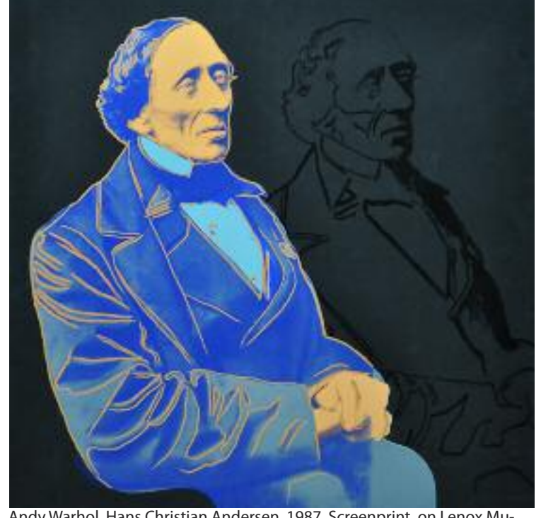
Andy Warhol, Hans Christian Andersen, 1987, Screenprint on Lenox Museum Board, 40 x 40 1/8 inches Collection of the Saint Mary's College Museum of Art, Gift of the Andy Warhol Foundation for the Visual Arts, Inc.